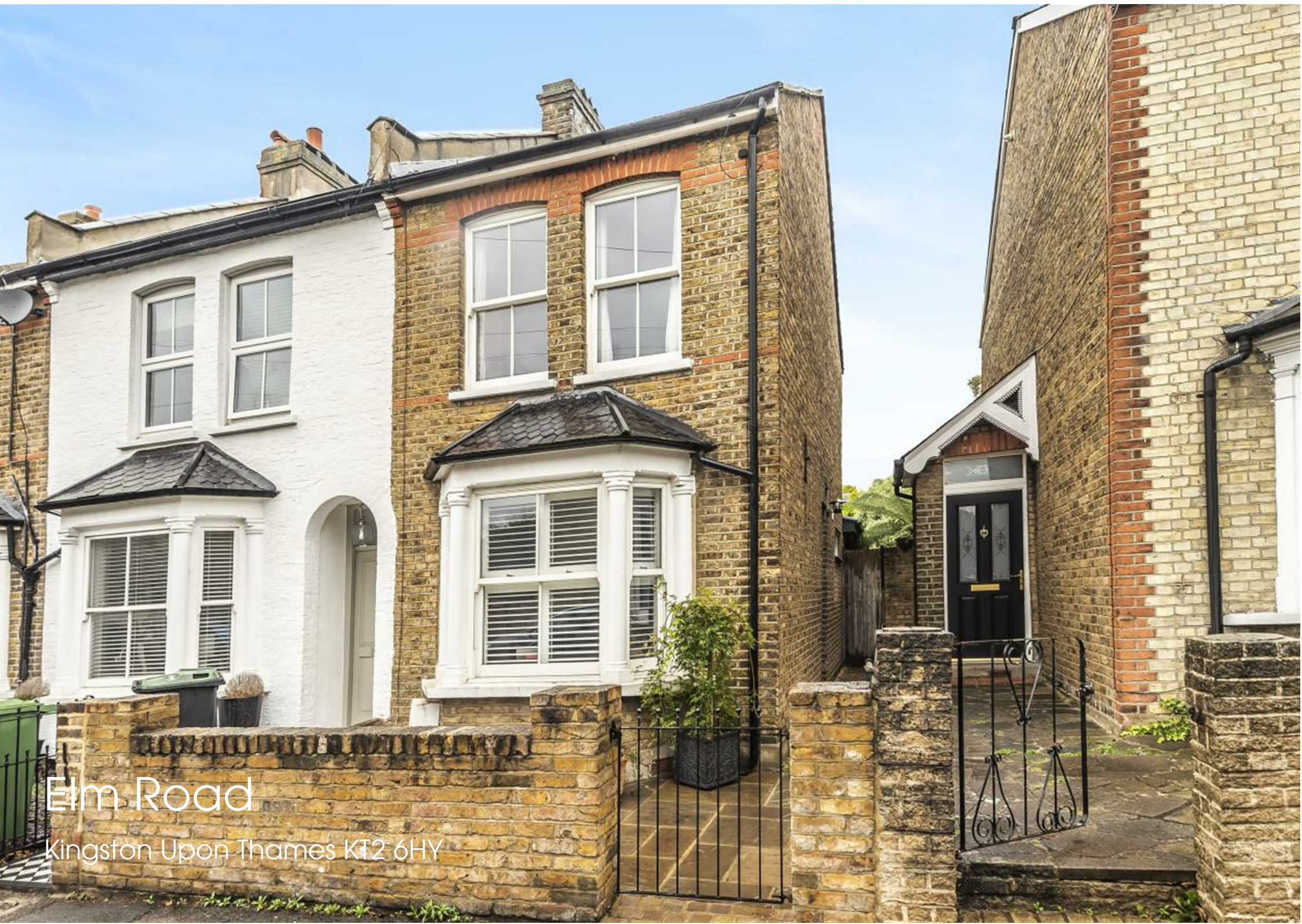
Elm Road Kingston Upon Thames KT2 6HY